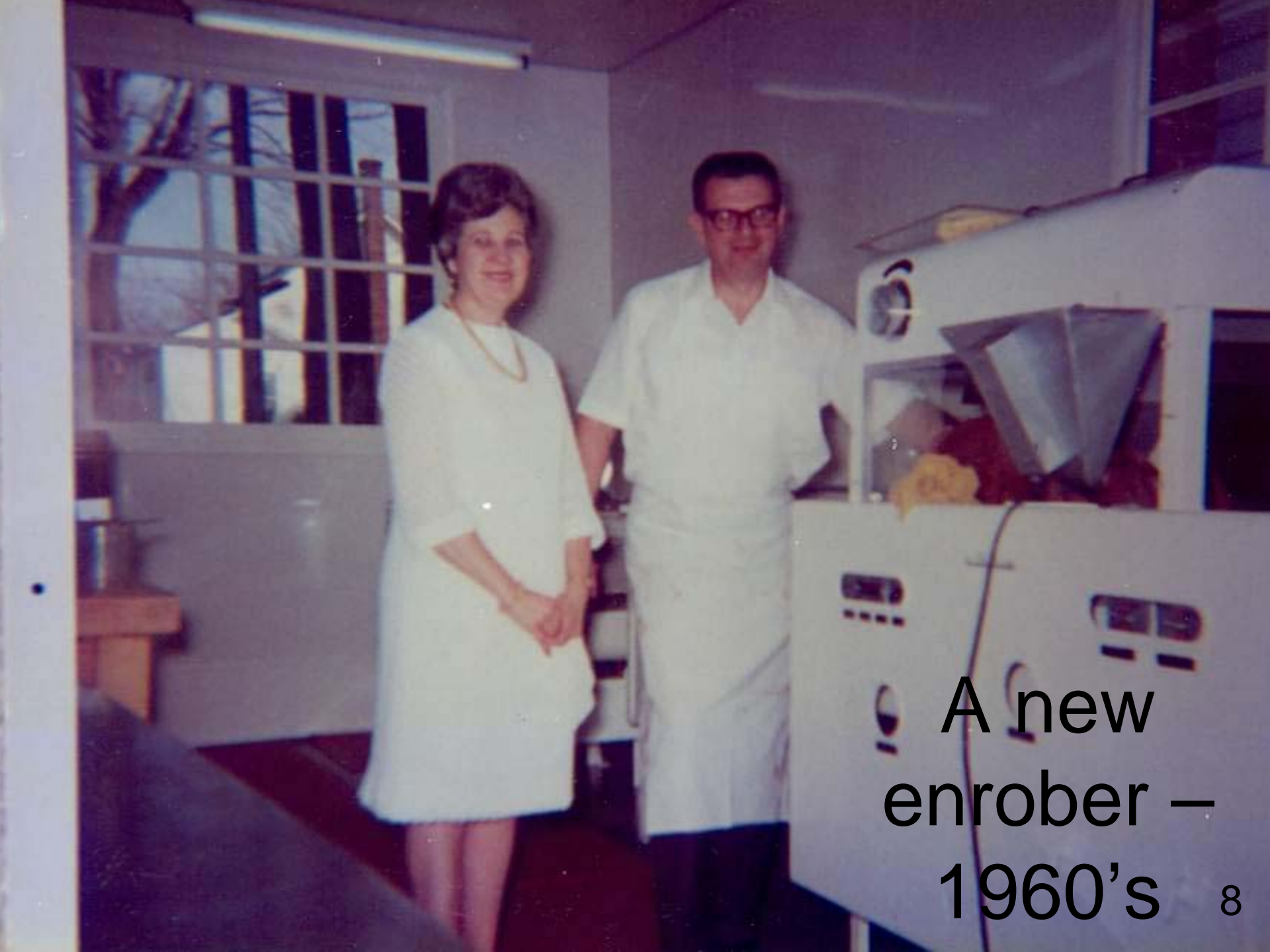
A new enrober – 1960's 8